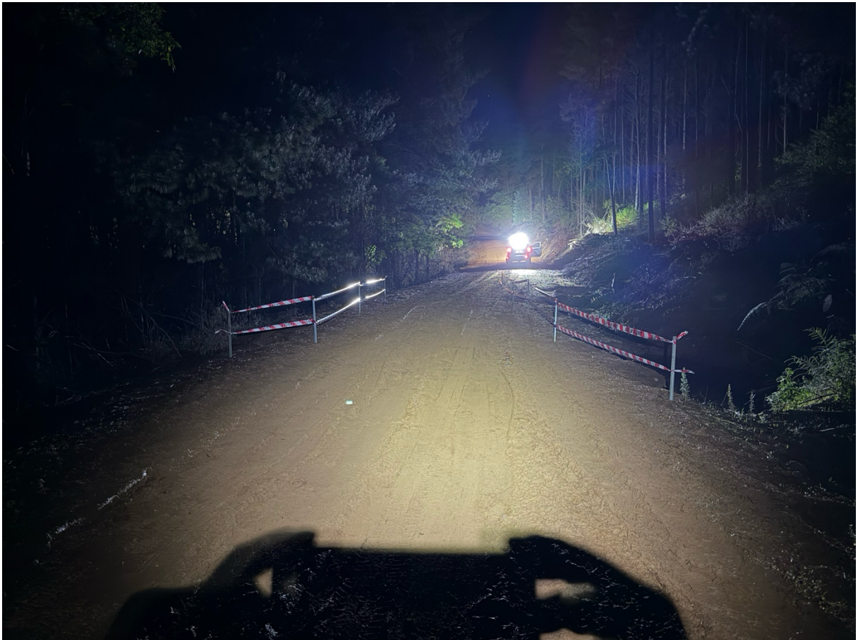
Ross Tapper Clerk of the Course